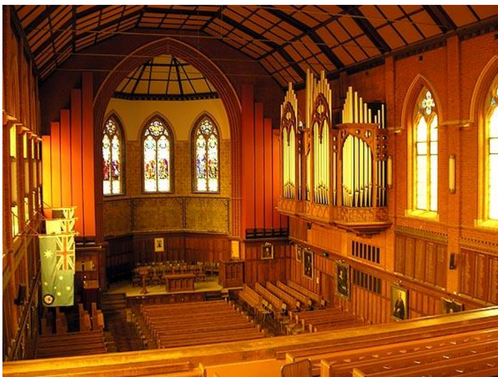
Memorial Hall at Scotch College, Melbourne