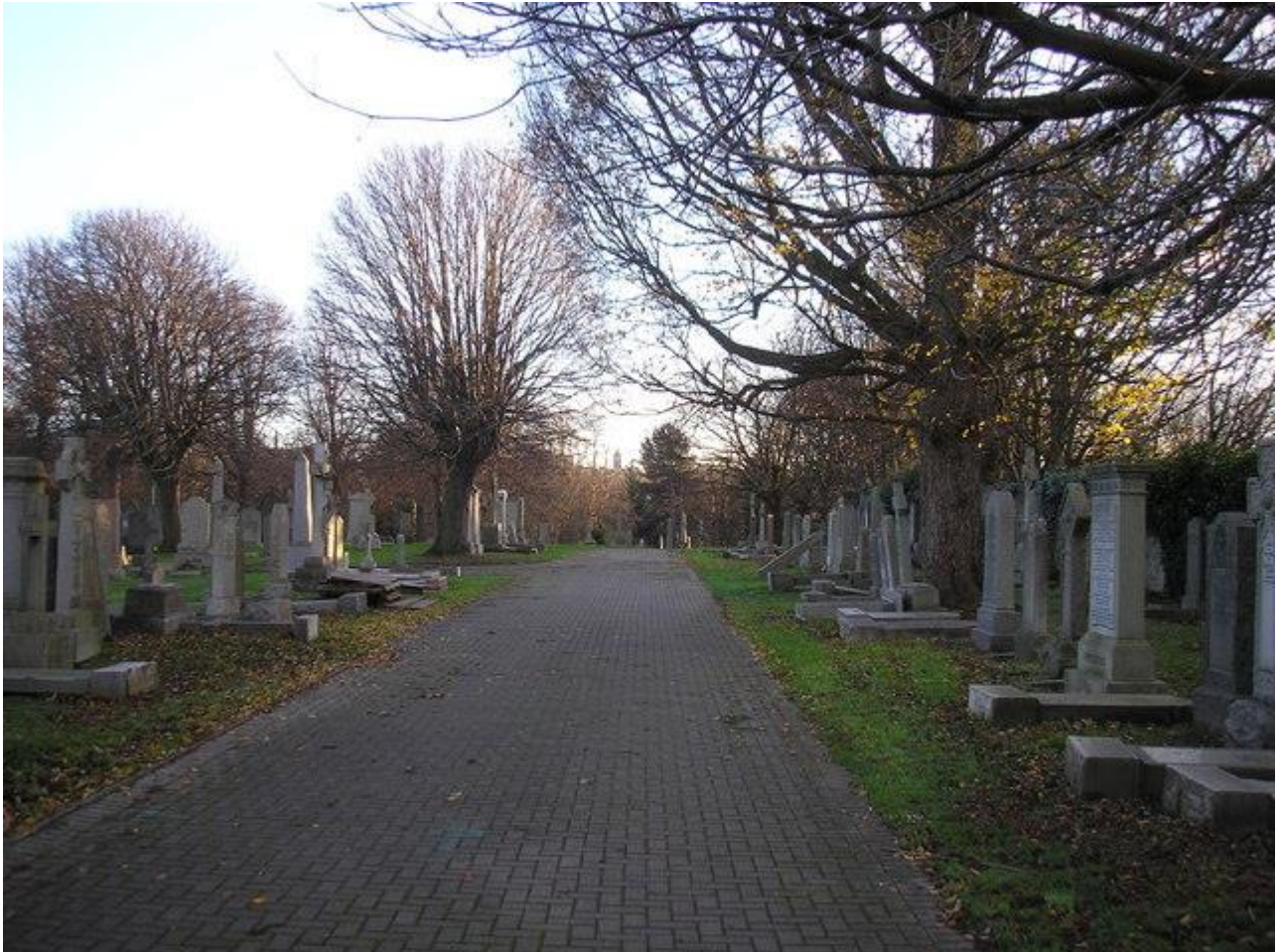
Warriston Cemetery, Edinburgh (Photo by Sandy Gemmill, 2006)