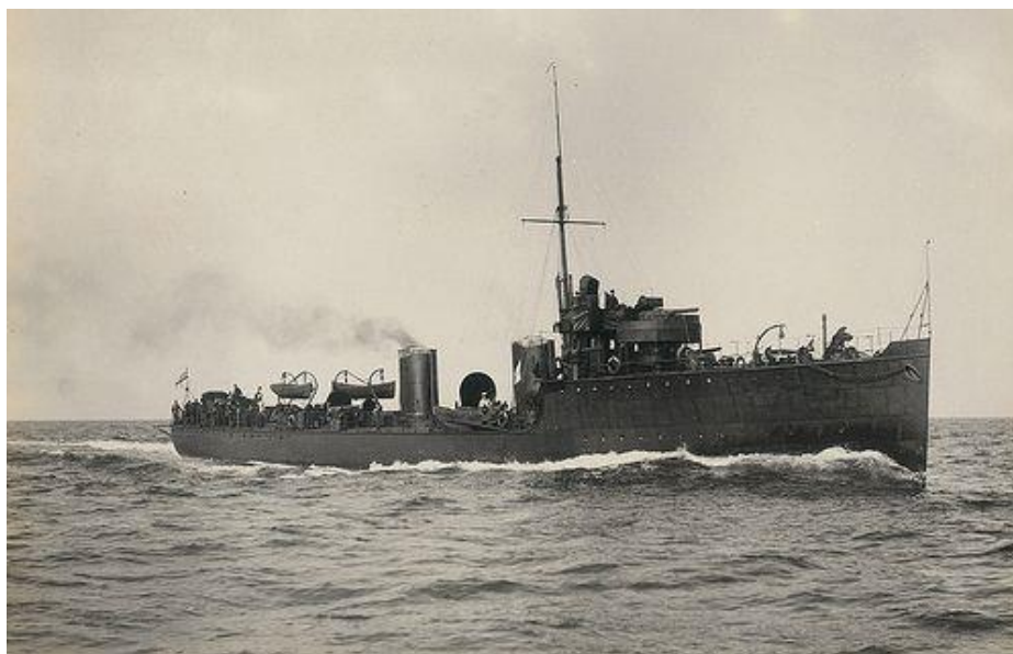
H.M.S. Kale c 1905

On 27th March, 1918 HMS Kale was lost after striking a contact mine in the North Sea with the loss of 41 officers and men.